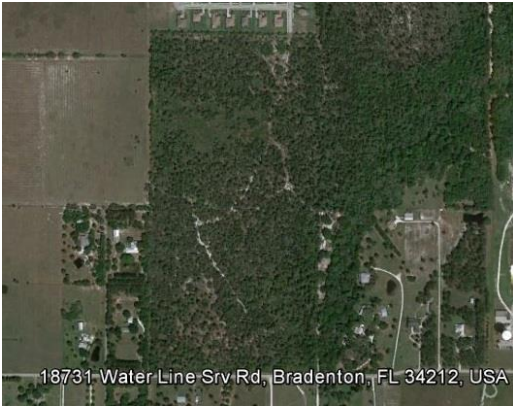
18731 Water Line Srv Rd, Bradenton, FL 34212, USA